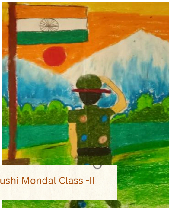
Arushi Mondal Class -II