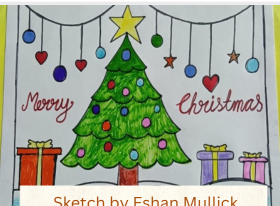
Sketch by Eshan Mullick Class- I