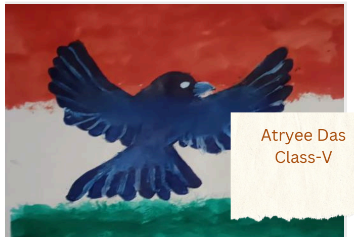
Atryee Das Class-V