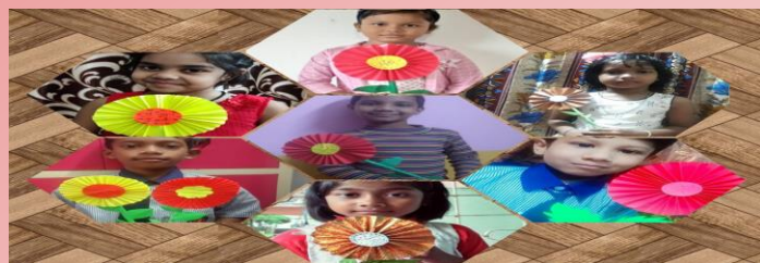
Activities of the Month of Pre Primary Classes. (origami, poster making on green diwali and paintings)