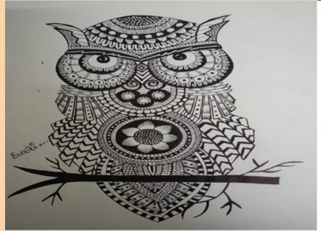
Swati Jaiswal Class -IX