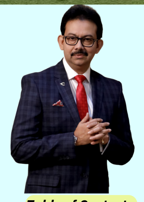
Table of ContentsPage 1. Message from theManaging Director.Page 1. Value of themonth - We the peoplePage 2. School ActivitiesPage 3. Eco Initiatives& CSRPage 4. Students' Corner.Page 4. Coming Up