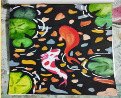
Shorashi Mondal Class-VIII