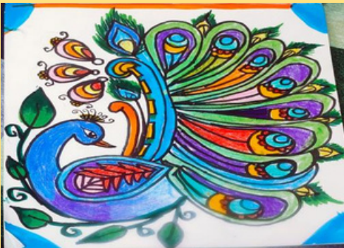
Green Gupta Class III