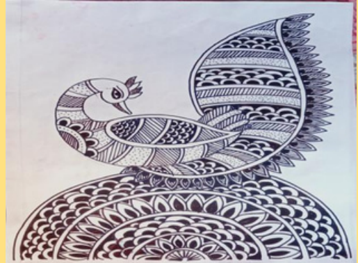
Gunjan Biswas Class VII